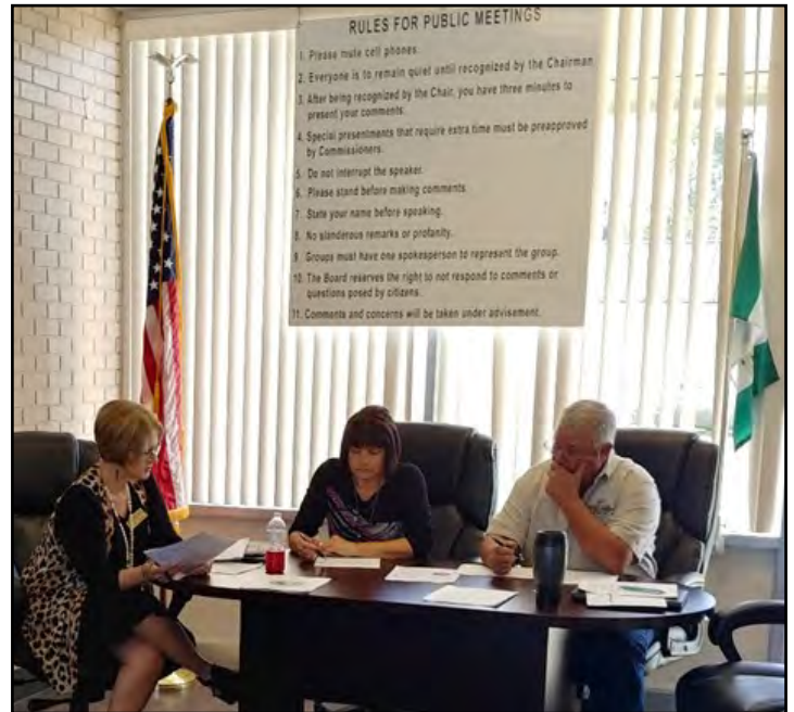
Echols County, Georgia (before COVID-19)

For additional details and localized assistance, SGRC Planning staff are available at (229) 333-5277.