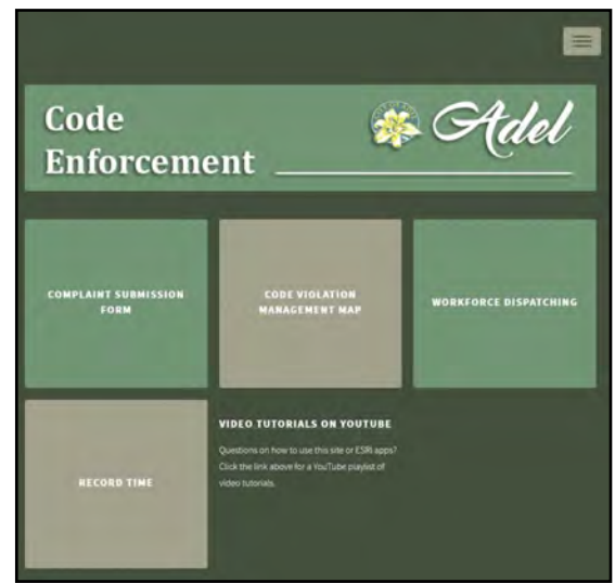
Pictured above is the City of Adel Code Enforcement program platform and pictured below is the complaint form.

Recently, the City of Adel approached the SGRC-GIS division looking for one such solution. The city wanted something that would allow city employees to work more efficiently in the field, keep track of time, and allow the city council to view the status of reported issues. To accomplish this, SGRC-GIS devised a multi-pronged approach and gathered it into a centralized internet platform. Initially, SGRC-GIS created a complaint form that could be accessed from any smart device or computer, so that city employees and council members can submit code enforcement issues. Next, SGRC-GIS created an ESRI Workforce application that allowed for seamless dispatching of the complaints and quicker response times from city employees. The complaints could also be viewed by code enforcement staff while out in the field, on smart phones, and by supervisors in the office. The City was able to see complaints/issues in real time and maintain records that followed the problem all the way through until completion or resolution. The final piece to this project was a solution that allowed code enforcement staff to keep track of the time spent working on each aspect of the job. SGRC-GIS built a web interface that enabled City staff to input time and location, which then allowed the supervisor to download Excel sheets to produce a report. For more information, contact Rachel Strom at rstrom@sgrc.us .